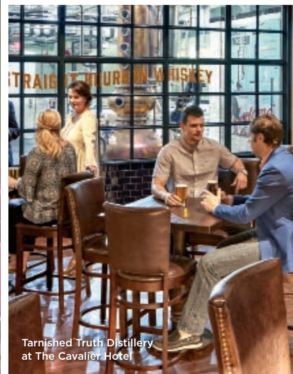
Tarnished Truth Distillery at The Cavalier Hotel