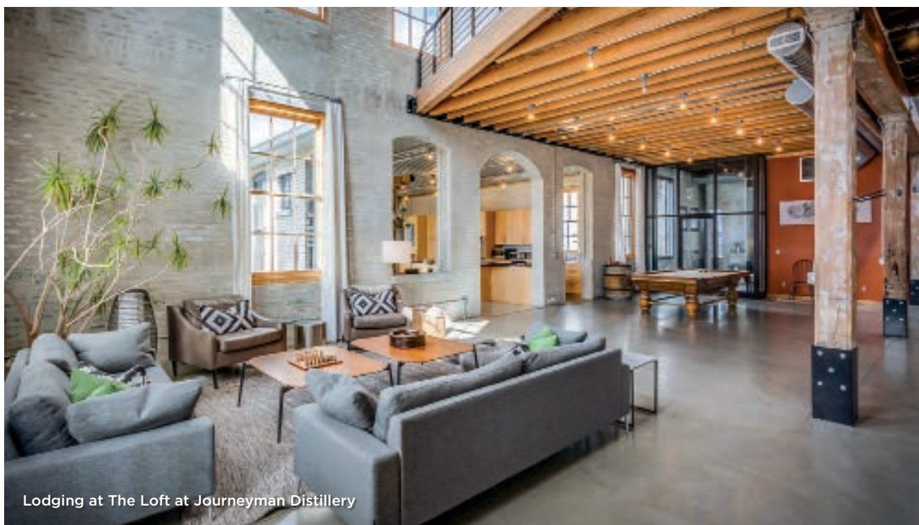
Lodging at The Loft at Journeyman Distillery