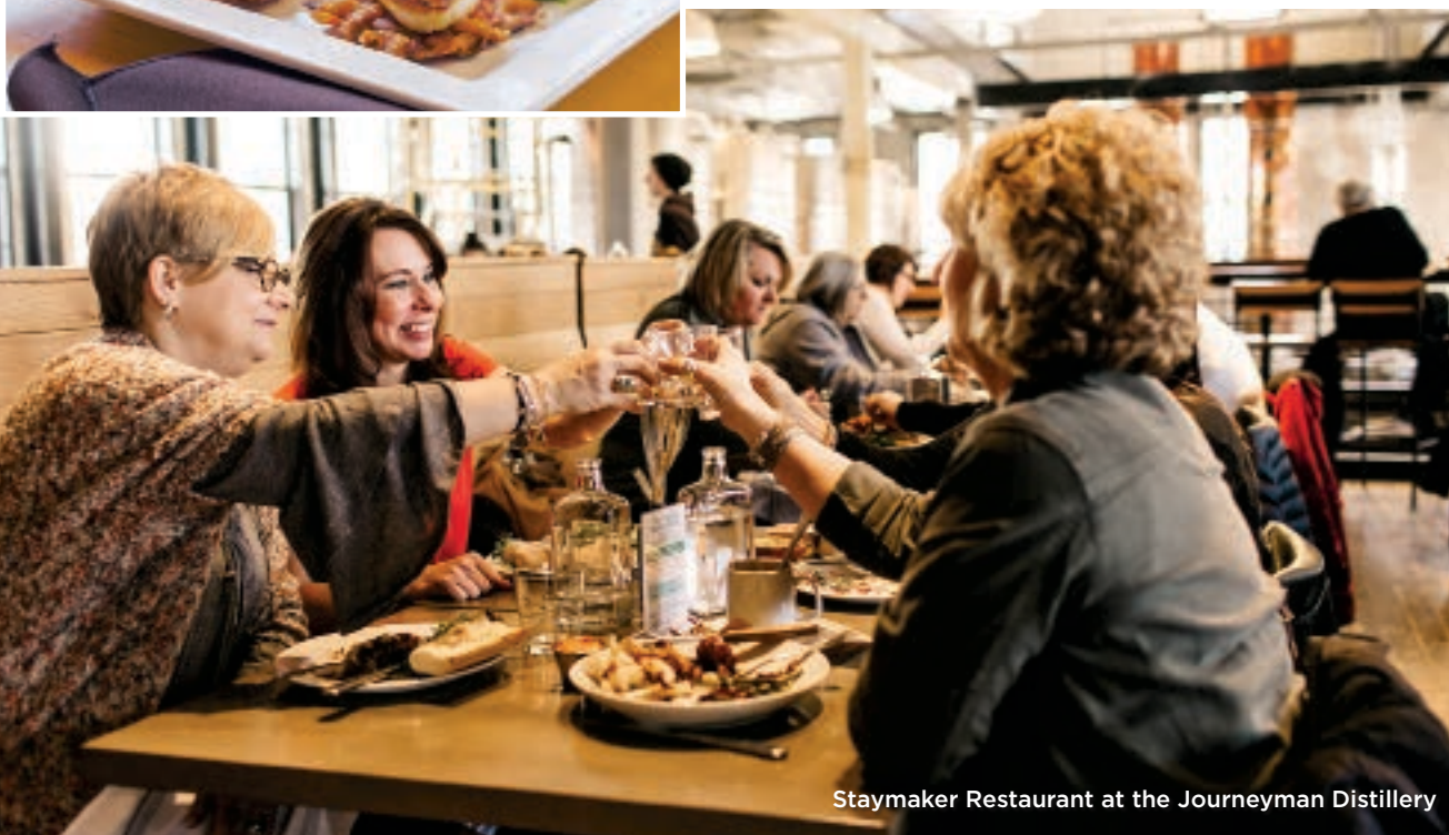
Staymaker Restaurant at the Journeyman Distillery