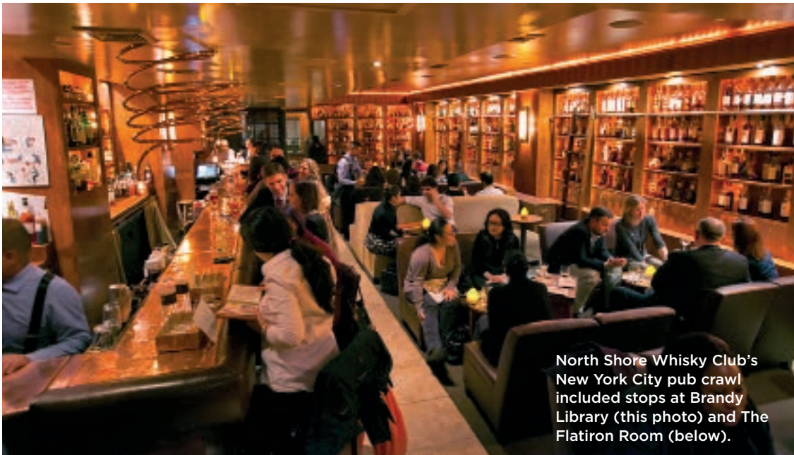
North Shore Whisky Club's New York City pub crawl included stops at Brandy Library (this photo) and The Flatiron Room (below).