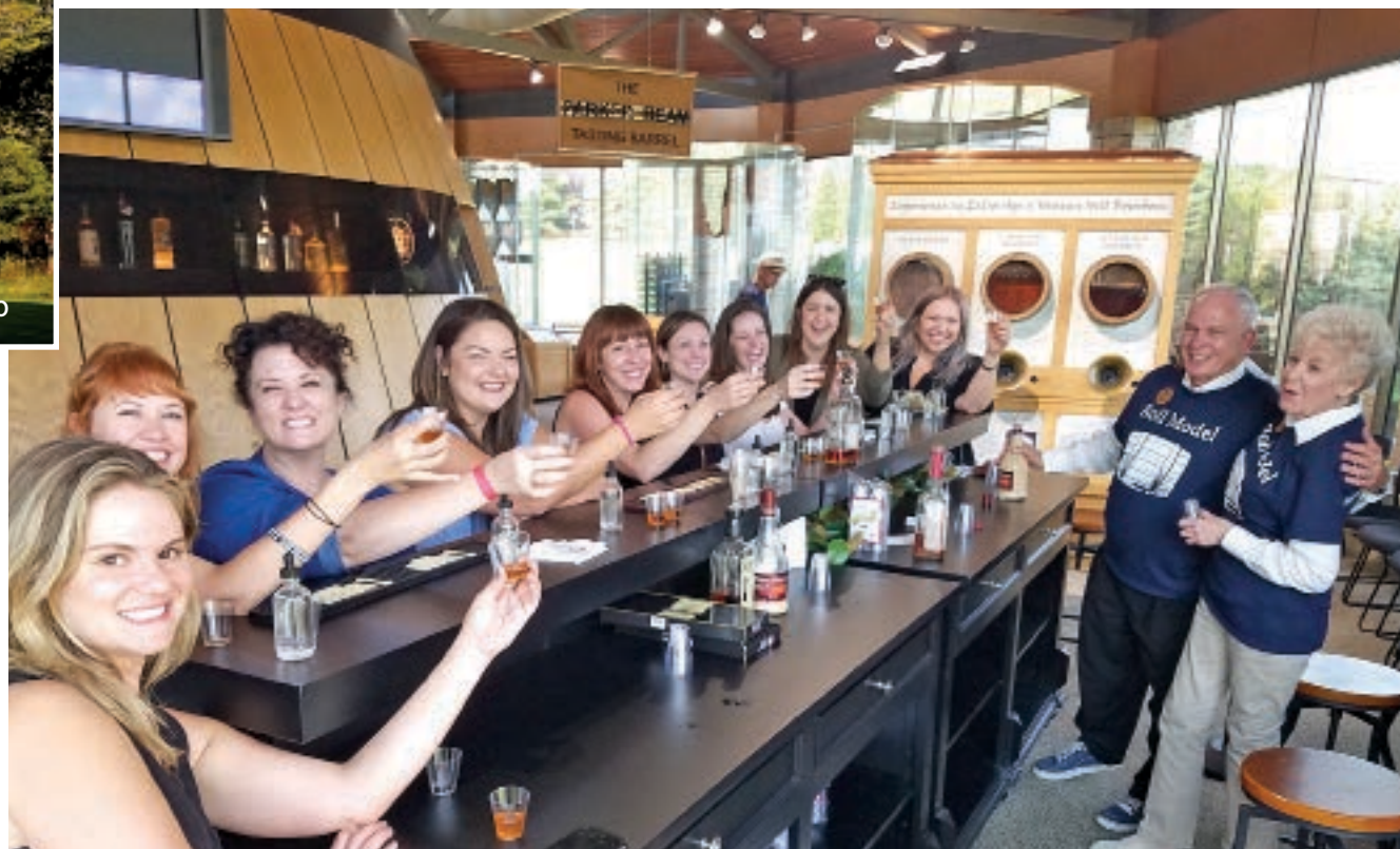
Above: Mint Julep Tours visits Heaven Hill in Kentucky. Below: The Tasmanian Whisky Trail includes Lark Distillery.

Tasmania's recent return to whisky making (resumed in 1992) now boasts more than a dozen distilleries.