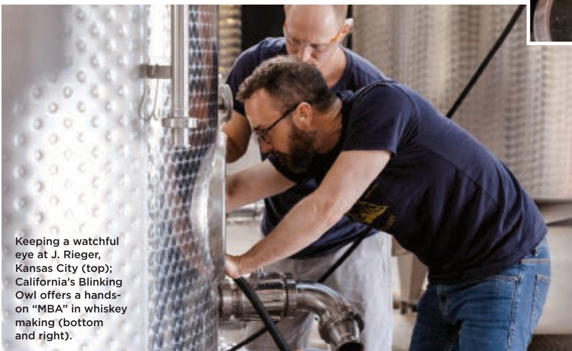
Keeping a watchful eye at J. Rieger, Kansas City (top); California's Blinking Owl offers a hands-on "MBA" in whiskey making (bottom and right).