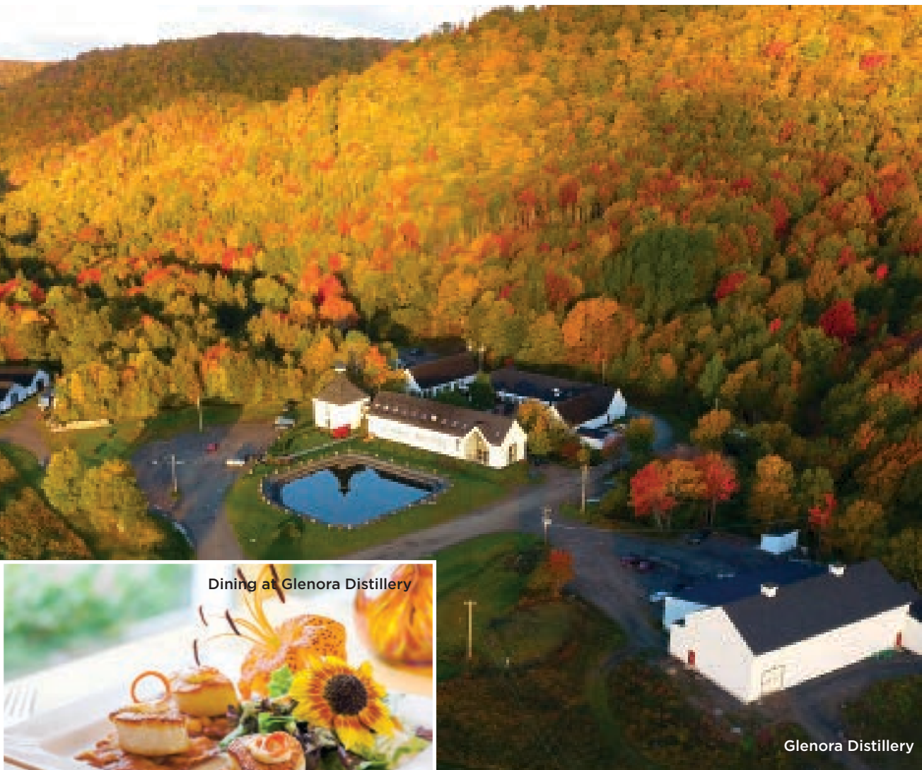
Dining at Glenora Distillery

Tarnished Truth is fully integrated into the Cavalier Hotel, an iconic 1927 neoclassic property with 85 guest rooms, three dining venues, and the full-service SeaHill Spa.